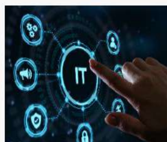
Computer Science (Georgian)