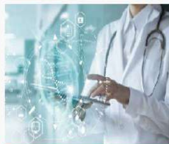
Medical Doctor (English)