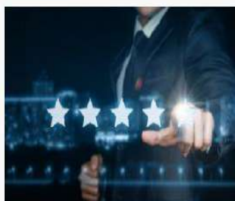
Tourism And Hospitality Management Undergraduate Program