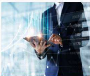
Business Administration Program