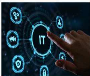
Computer Science (English)