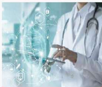
Medical Doctor (Georgian)